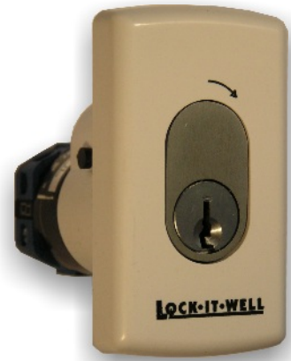
The Example shown is for a O-Series Lockwood 570, Switch mount, with Spring Return one way with a Multi-Voltage Contacts